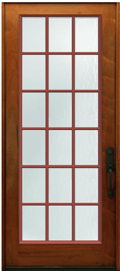
Full Lite with muntins