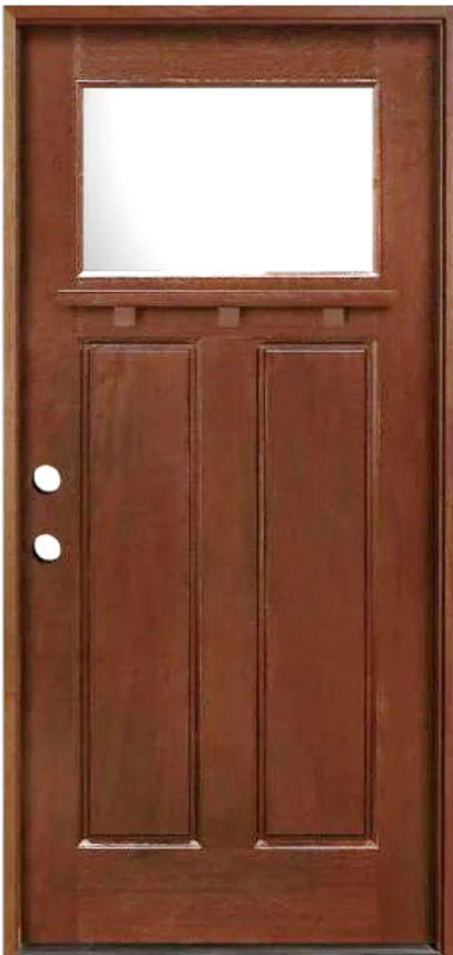
Craftsman with single 1/3 Lite