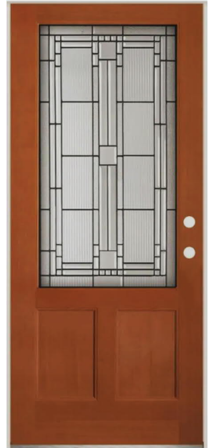
3/4 Lite in decorative frosted glass