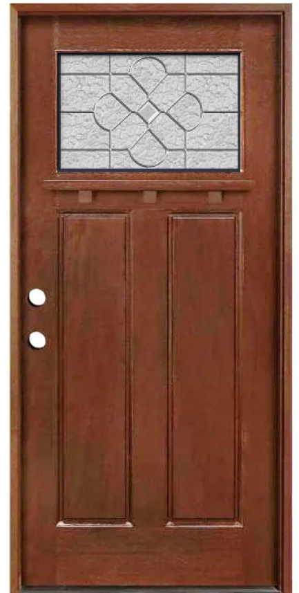
Craftsman with 1/3 Lite in decorative frosted glass