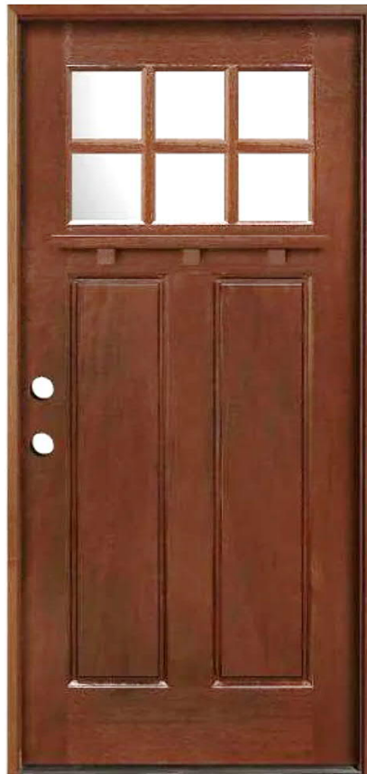
Craftsman with 1/3 Lite with muntins