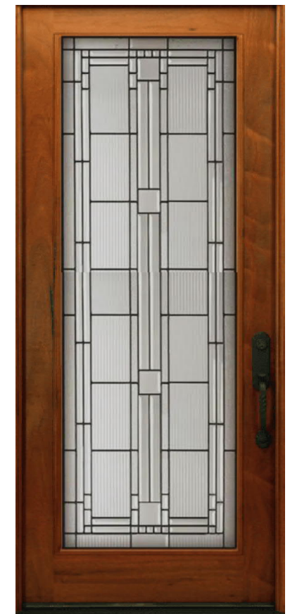
Full Lite in decorative frosted glass