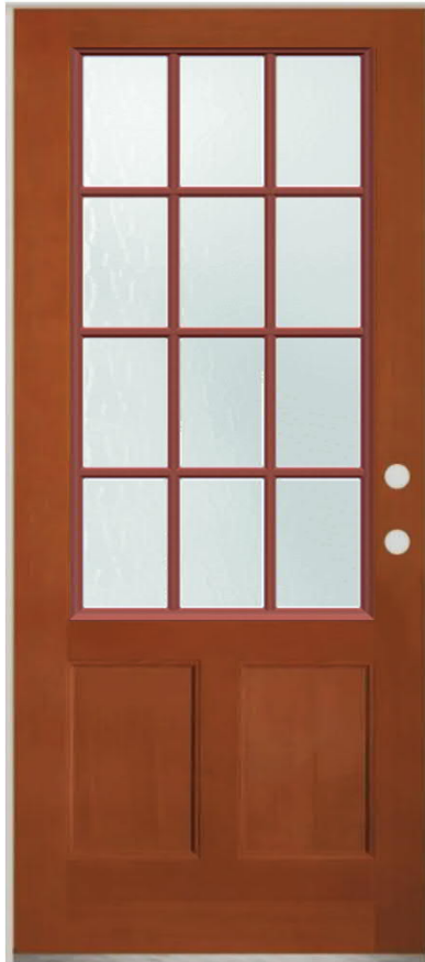
3/4 Lite with muntins